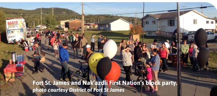
Fort St. James and Nak'azdli First Nation's block party.